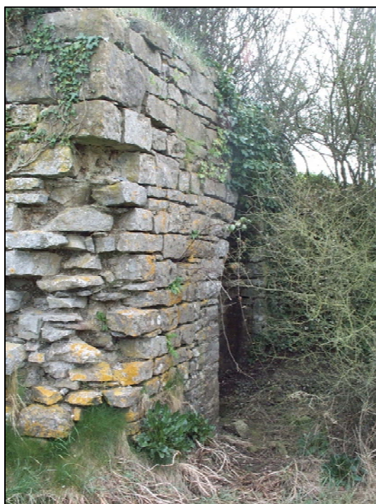
PRN 17903 Damage to corner