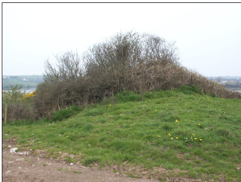
PRN 17903 Charging ramp from SW.