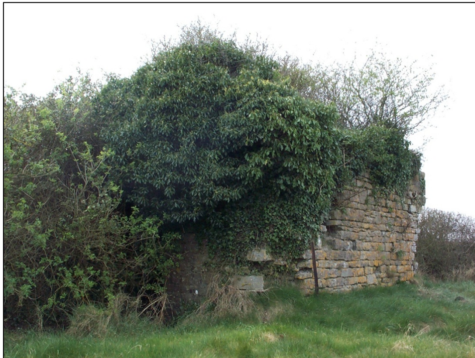
PRN 17903 Ivy over structure from north east

Maps based upon Ordnance Survey material with the permission of Ordnance Survey on behalf of the Controller of Her Majesty's Stationery Office Crown copyright. Unauthorised reproduction infringes Crown copyright and may lead to prosecution or civil proceedings'. Welsh Assembly Government 100017916. 02.28.13