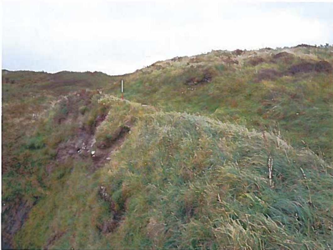
Photo 2: Castell Heinif. Pinch point of former coast path between inner bank of fort and cliff erosion. Scale 1m. View E