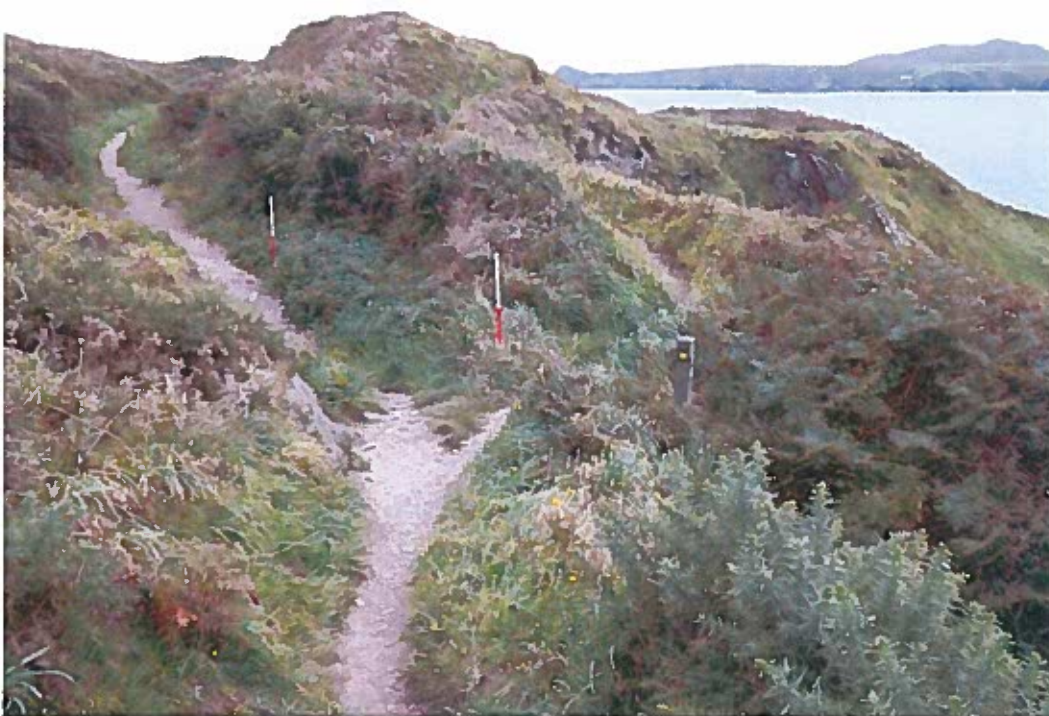
Photo 6: New path and sign 17/09/2012. The slight remains of the hedge bank (Photo 4) is adjacent to the left scale. Scales 1m. View SW