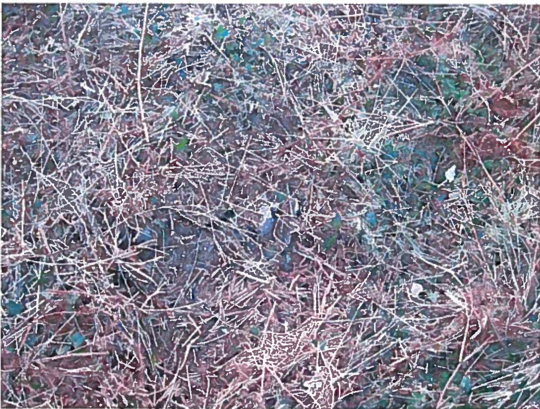
Photo 4: Castell Heinif. Remains of hedge bank in northern end of inner ditch. View S