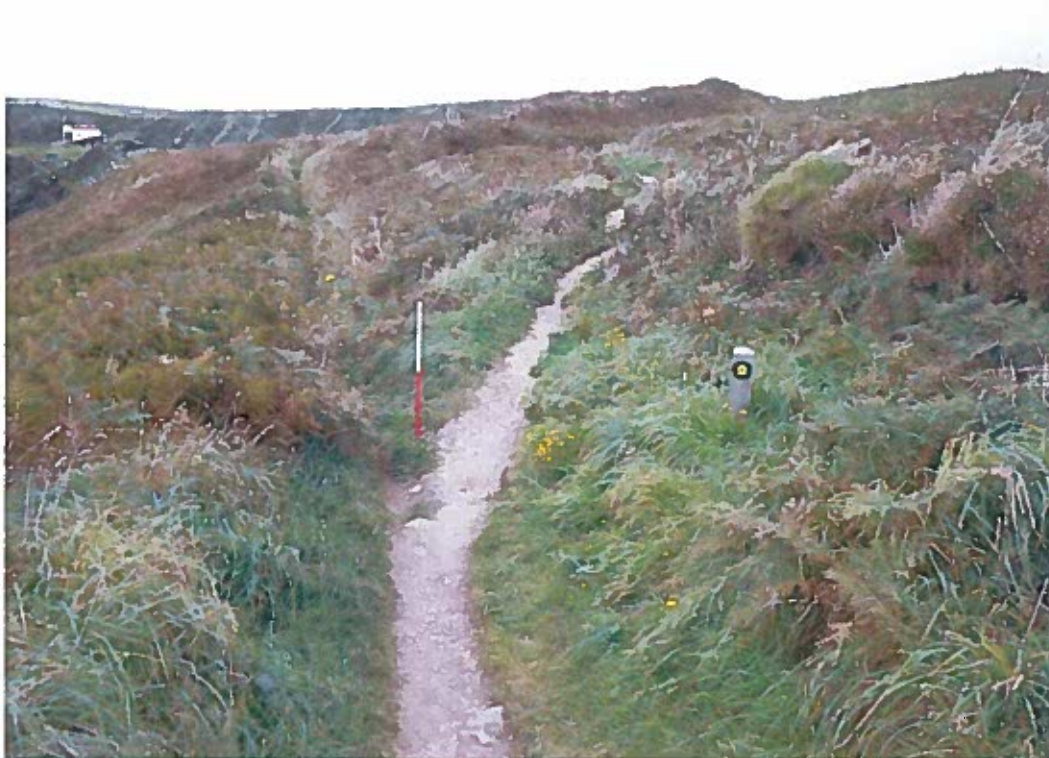
Photo 5: New path and sign, old path to left 17/09/2012. Scale 1m. View N