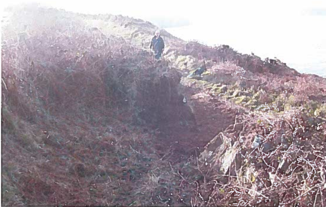
Photo 3: Castell Heinif. New route through hedge bank to the south of fort. View S