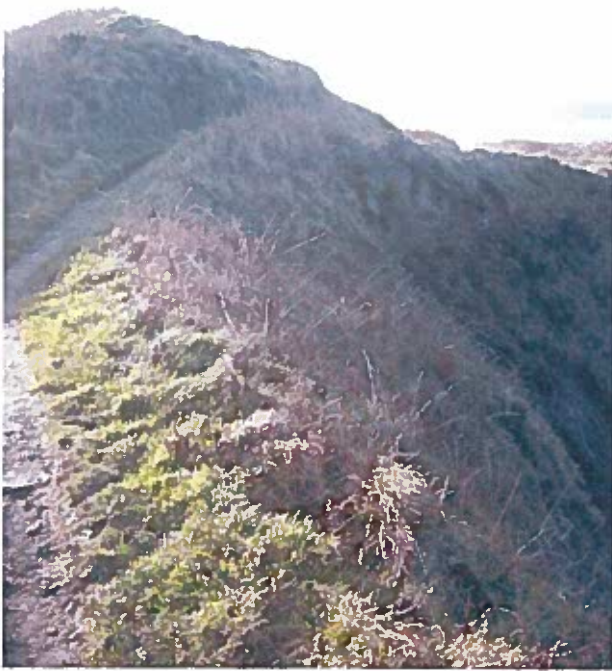
Photo 1: Castell Heinif. Pinch point of former coast path between inner bank of fort and cliff erosion. View SW