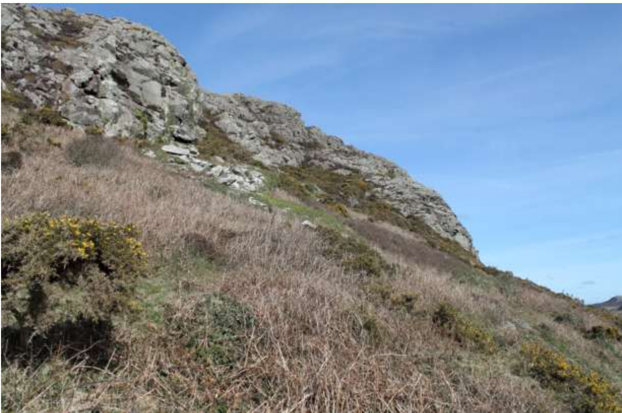
The slopes of Carn Llidi where Marauder 41-18252 crashed on the 6 th June 1943