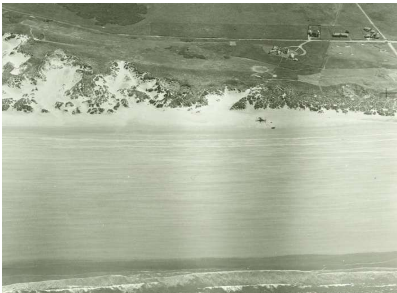
Aircraft crashed on Borth beach, shown on RAF aerial photograph 1940

Prepared by Dyfed Archaeological Trust For Cadw