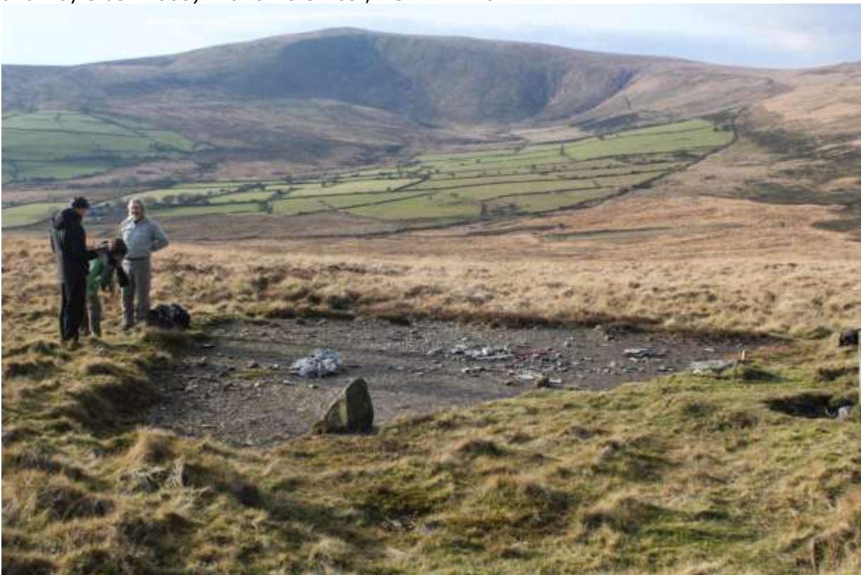
The crash site of Liberator EV881 where 6 crewmen died.

The Liberator belonged to GR (general reconnaissance) VI of 547 Squadron based at St Eval, Cornwall. The aircraft flew into Carn Bica, Preseli Hills at night on 19 September 1944. Six crewmen were killed, 3 survived. In 1984 (50th anniversary), a memorial was placed at the crash site by the Pembrokeshire Aviation Group which was visited by relatives on the 60th and 70th anniversaries. The crew were tasked with anti-submarine duties from St Eval and were deployed to rendezvous with a RN submarine to practice radar and Leigh Light skills. Instead of skirting Wales and using the Smalls lighthouse as the navigational fix, the crew cut across the tip of south-west Wales to make sure that they made the rendezvous. The Squadron Operational Record Book notes at 'approximately 22:50 hours on September 19th, during the hours of darkness, aircraft EV881, flew into the crest of a hill 4 miles northeast of Maenclochog, South Wales. The aircraft caught fire and W/O two of the crew were killed; another died in hospital and the remaining three were injured and detained in hospital. The cause of the accident is believed to be an error of navigation as the crew were briefed to proceed to an 'Oasthouse' exercise via the Smalls light'. The court of inquiry heard that the altimeter had been set wrongly and was reading too high. (F.Sage, 2013 based on Evans, 2005 and Doylerush 2008). Maritime Officer, RCAHMW 2011