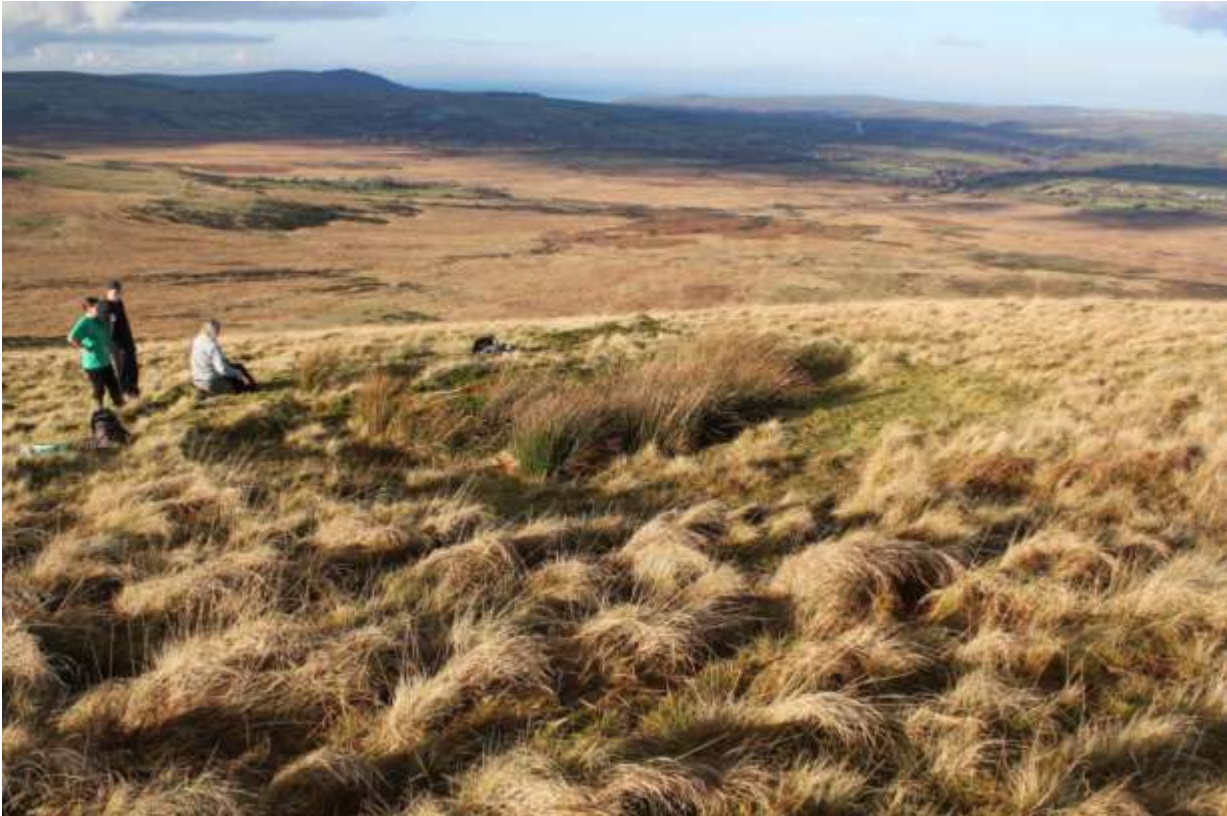
The possible site of the buried remains of the Fairey Battle K7688