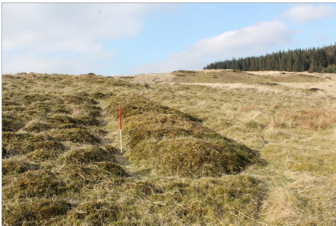
PRN 105415 PEN RHIWIAR, Carmarthenshire. A good example of a typical pillow mound. This is one of a group of four sited close together on high open moorland to the north east of the Gwenffrwd valley, Carmarthenshire.

Rabbits do not thrive in damp conditions and need well drained soil to live in. The ditch surrounding the mound would have helped to keep the burrows dry and positioning the mounds perpendicular to the slope would also have aided this.