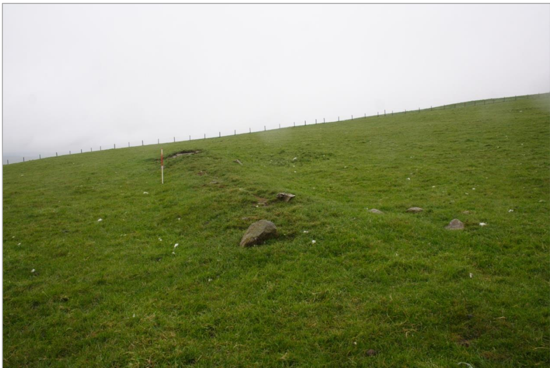
PRN 105396 MYNYDD MELYN, Pembrokeshire. A long cigar-shaped pillow mound. The top photograph shows the internal stone structure of the mound revealed by a sheep scrape.