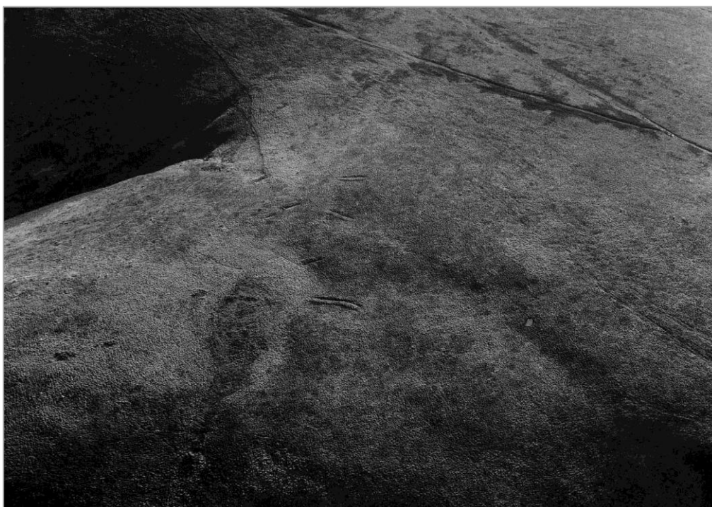
PRN 13546 & 105390/4 MYNYDD MALLAEN, Carmarthenshire. A group of 6 pillow mounds on high unenclosed moorland at 380m above sea level.

Smaller pillow mound groups have survived particularly on high upland areas. On a high northeast facing slope of Mynydd Mallaen, Carmarthenshire is a group of 6 linear pillow mounds (PRN 13546 & 105390-4), that can be seen in the aerial photograph below. They range in length from 20m to 10m.