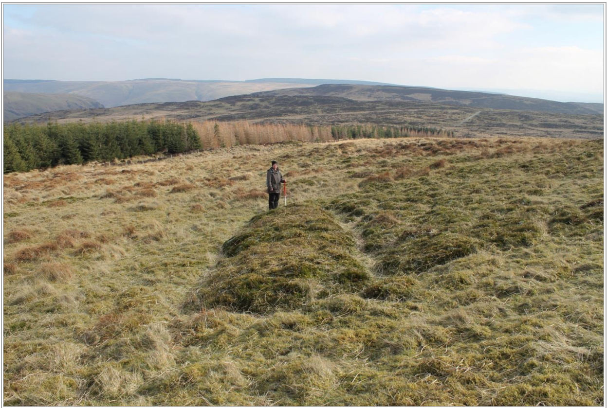
PRN 105415 One of a group of 4 pillow mounds on high open moorland, near, Rhandirmwyn, Carmarthenshire.