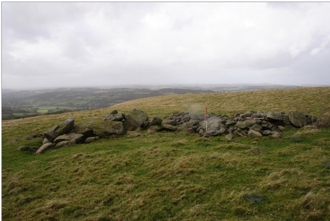
BRYN CYSEGRFAN 2012. Nearly all the pillow mounds were bulldozed flat during land improvement work in the late 1970's and the stone slabs used to construct the internal passages and nesting places within the mounds are now in neat piles by the edge of the field.