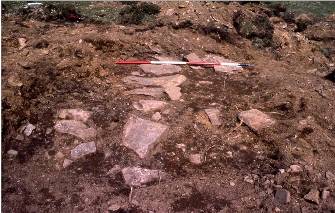
BRYN CYSEGRFAN, Ceredigion. A photograph taken in May 1978 showing the arrangement of stone slabs within a pillow mound. This pillow mound was later bulldozed flat.

from slabs of stone within the mounds. The group of over 30 pillow mounds were surveyed, with some excavation, in advance of agricultural improvement.