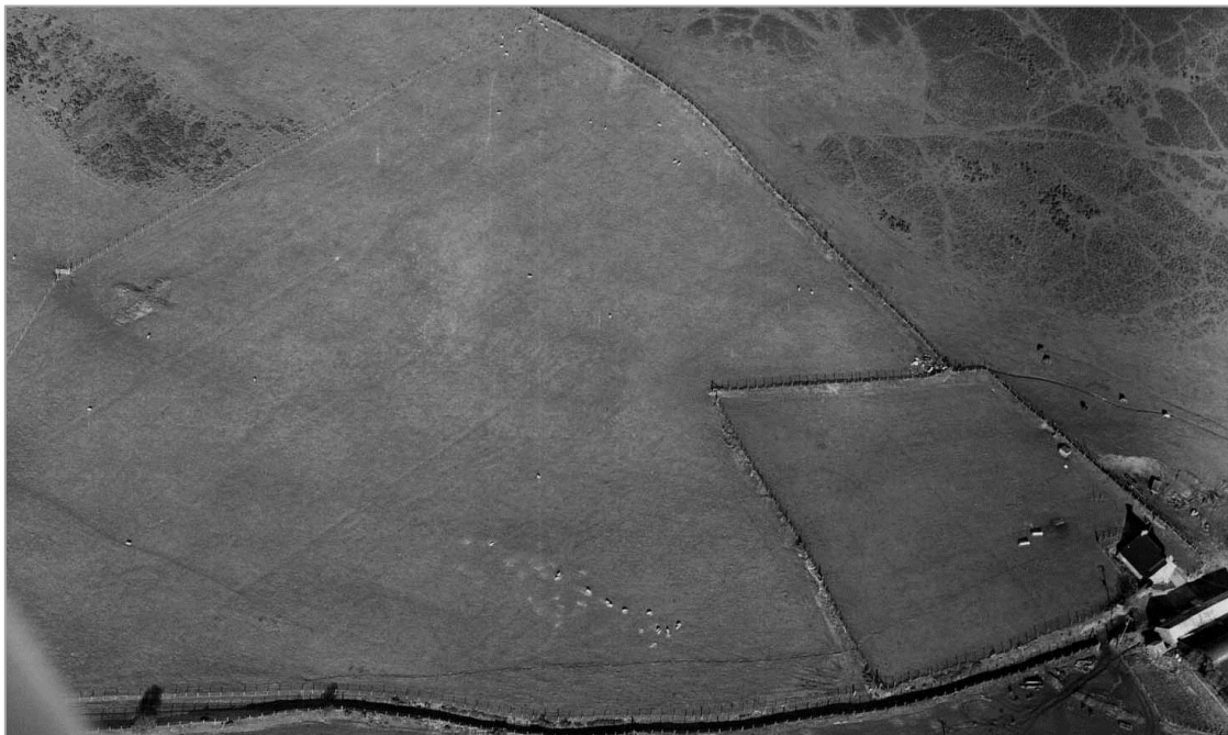
PRN 11327 GERNOS FACH A cross shaped pillow mound situated on a gentle south west facing slope 250m NW of Gernos fach farm, Preseli. The top photograph shows the site visit in 2012 and the lower photograph is an aerial photograph taken by DAT in the 1980's – the cross-shaped mound can be seen on the left hand side (DAT AP85/33.17).