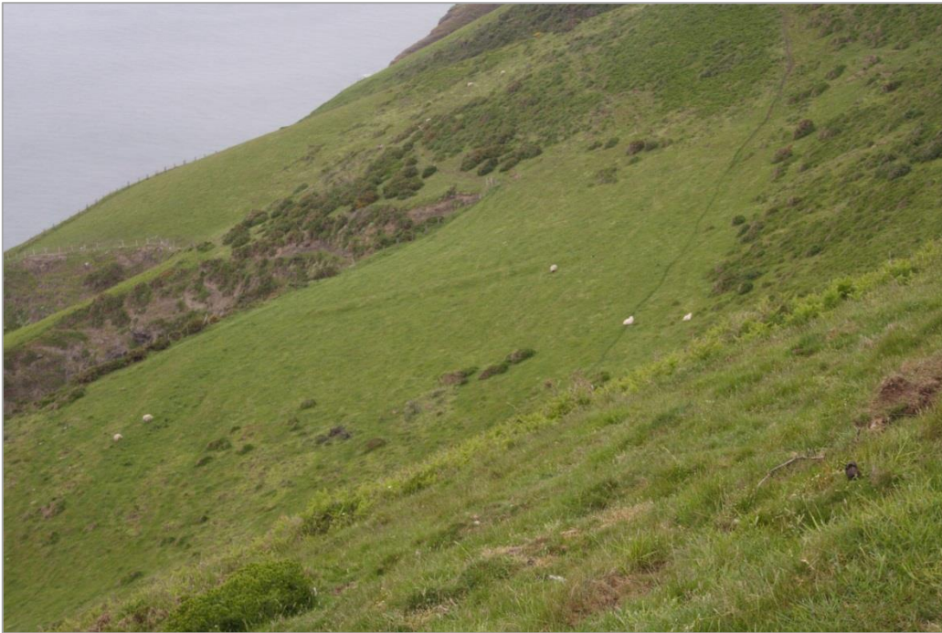
PRN 31439 PEN Y GRAIG, Ceredigion. Two pillow mounds that lie at right angles to each other. Located at the foot of a northwest facing slope on a natural terrace near the cliff edge.