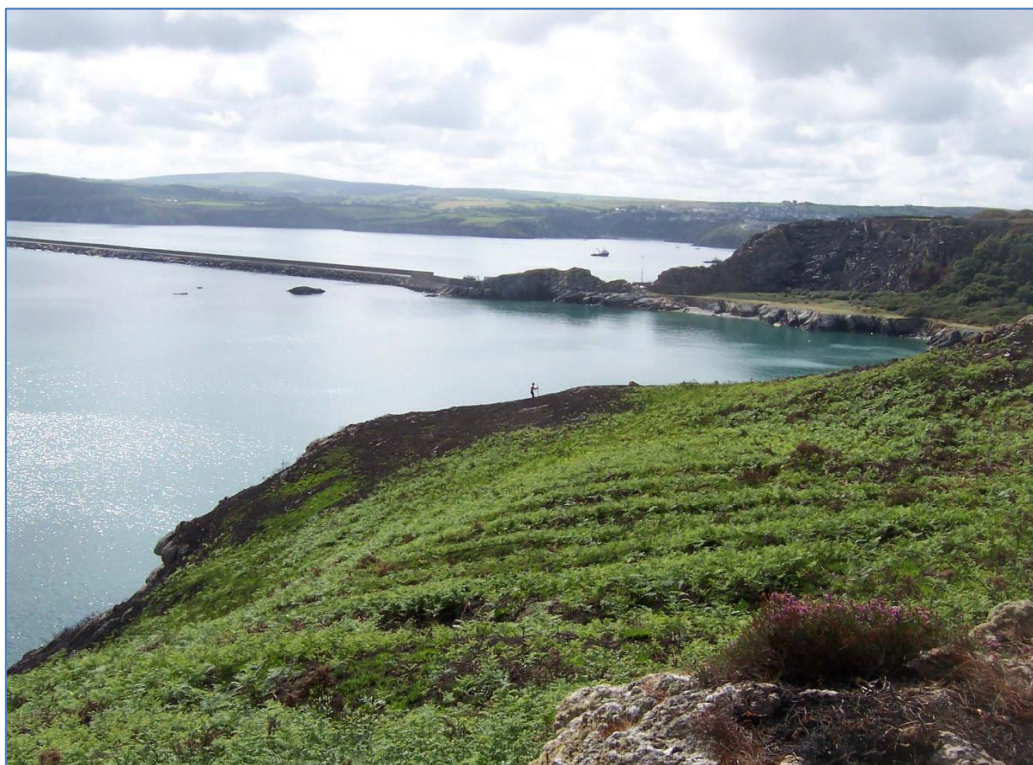
PRN 32100 THE WARREN, Pembrokeshire. Taken in 2004 a few months after the vegetation had been burnt off, this photograph shows a set of seven pillow mounds lying near the cliff edge. Map evidence suggests a date between 1845 and 1867, and the sharp profile of the mounds supports a relatively recent date.