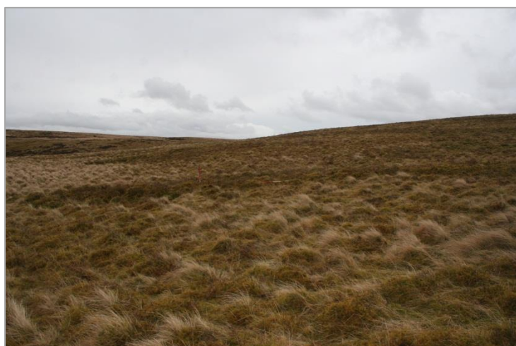
PRN 13546 MYNYDD MALLAEN Looking south at the pillow mound seen in the foreground of the aerial photograph above. The E-W mound is slightly curved, and measures c. 20m long and 2.5m at its widest. There are shallow ditches visible flanking the long sides but not at the ends. The southern ditch is more pronounced and has reeds growing in it.