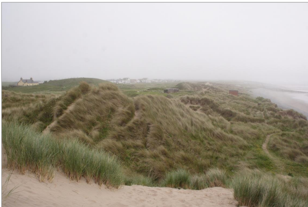
PRN 105401 YNYSLAS WARREN, Ceredigion. Twyni Mawr sand dunes, Ynyslas is recorded as a breeding place for rabbits in the post-medieval period