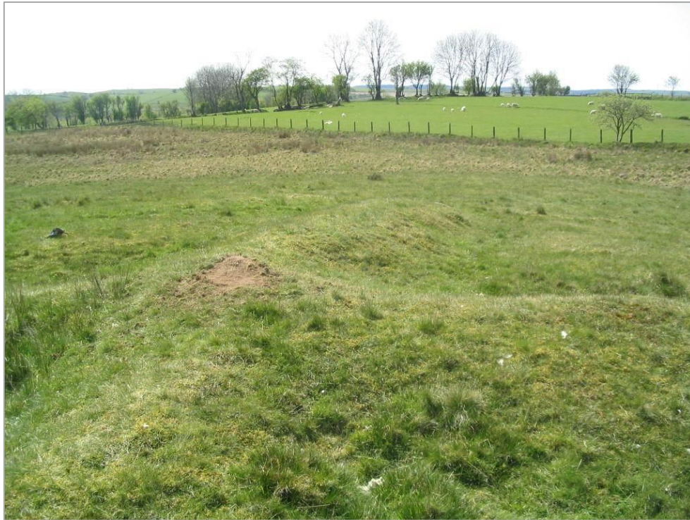
PRN 105471 TYNLLWYN, Ceredigion. A cross-shaped pillow mound built in a slightly elevated position in otherwise boggy ground. situated northeast of Blaenyorfa farm, Ceredigion.