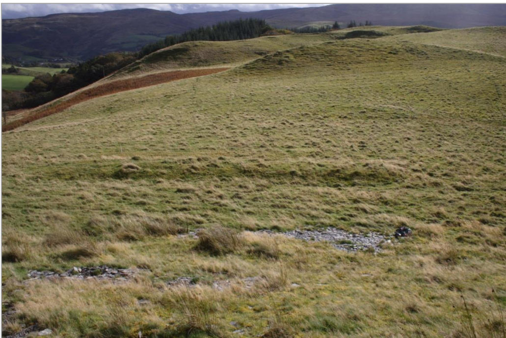
PRN 42159 NANT CRAFANGLACH, Ceredigion. This pillow mound measures 20m long and 6m wide. Unusually the mound is quite high at 0.80m.